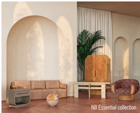
NB Essential collection